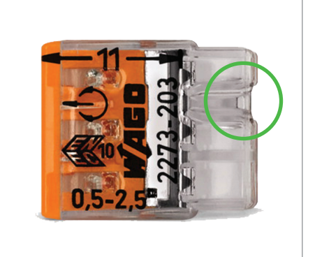
Test slot Back of the housing