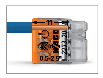
1. Strip the conductor 11mm.